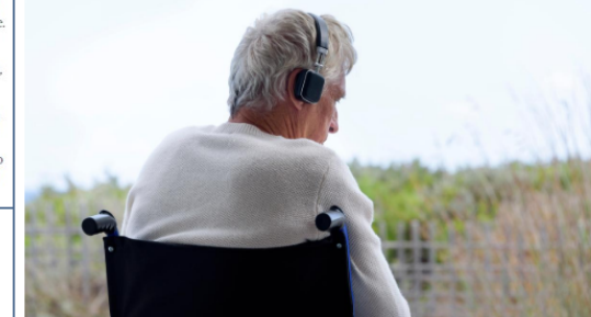
Music therapy could be an effective alternative to sedatives

Massage and music therapy are more effective than sedatives at calming people with dementia, according to a study whose authors say it is time to move away from drugging patients.