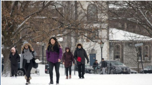
The University of Toronto is using Donald Trump and Brexit to attract international students to Canada